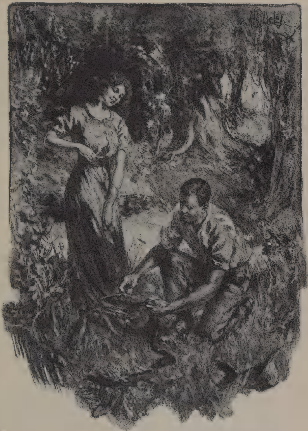
THEY TOGETHER, BACK IN THE SWAMP, SHADOWED BY THE FOLIAGE, BEGAN TO FASHION THE WONDERFUL GARMENT